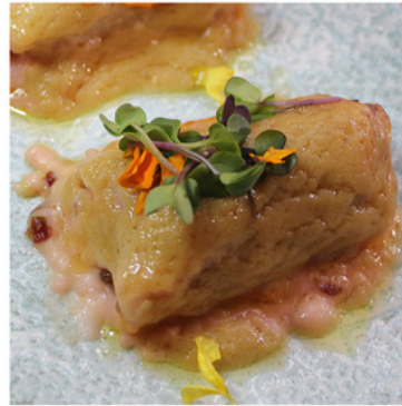
CANELÓN RELLENO DE PATO Y FOIE