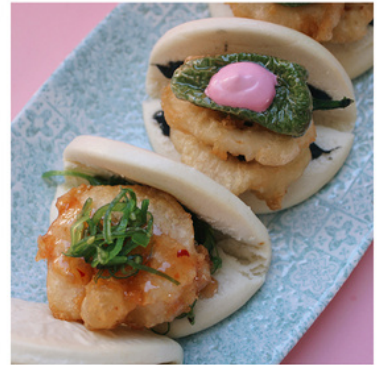
BOCADILLO BAO A DOS SABORES