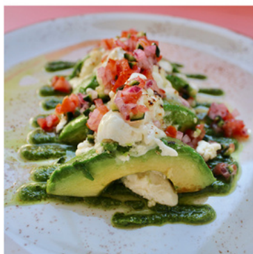
GRILLED AVOCADO WITH PICO DE GALLO AND GOAT CHEESE