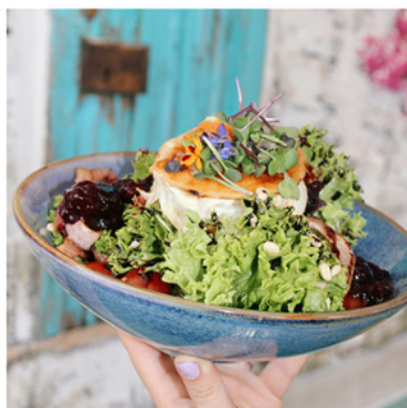
GOAT CHEESE SALAD