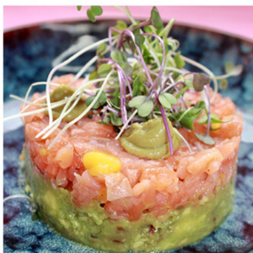
SALMON TARTAR WITH MANGO AND GUACAMOLE