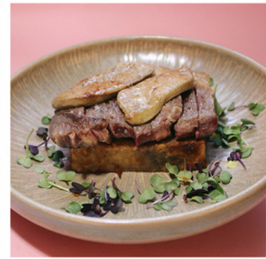
LOW LOIN OF MATURED PASTURE COW WITH FOIE