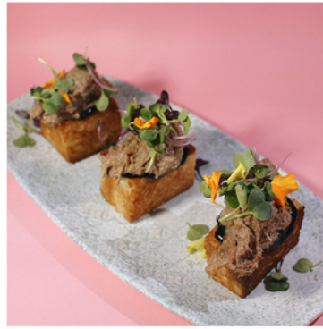
BRIOCHE OF VEAL MEAL WITH CURRY